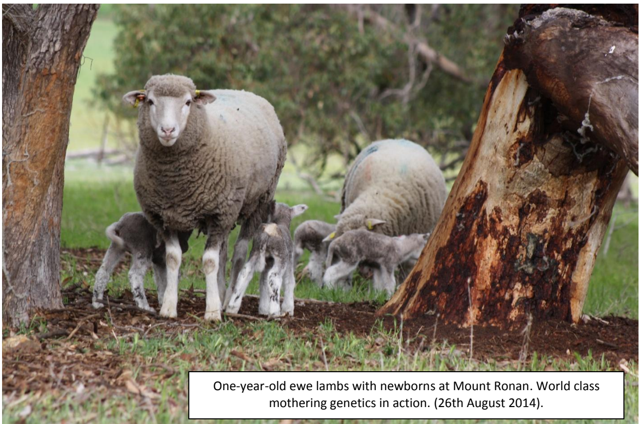
One-year-old ewe lambs with newborns at Mount Ronan. World class mothering genetics in action. (26th August 2014).

ACCREDITED BRUCELLOSIS FREE FLOCK No. OV/AC/044