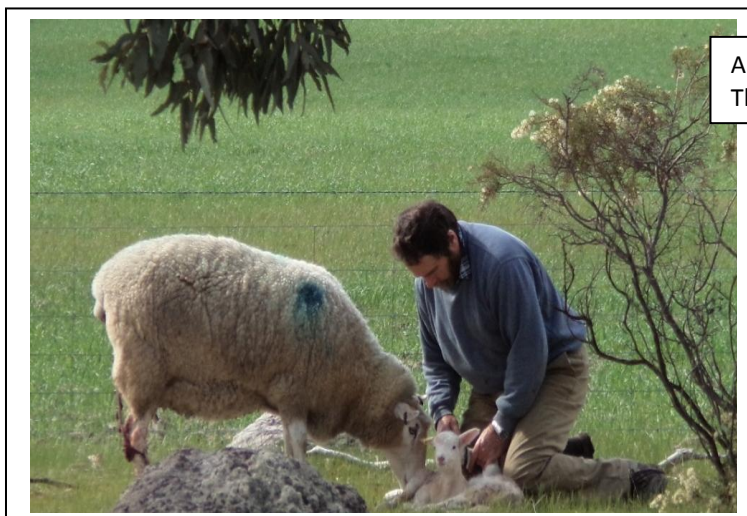
An MS10 ewe at lamb tagging time, 2013. This ewe produced natural triplets in 2014.

But generally, an outstanding mother is always an outstanding mother.