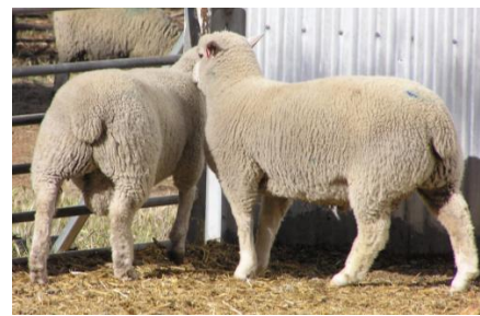
2006 drop White Suffolk lambs at Mount Ronan. Muscular, growthy, high-yield genetics have always been the focus over the decades.

The hardy Mount Ronan White Suffolk genetics powers our Maternal program. These genetics go back directly to the outstanding Suffolk flock I founded in 1969.